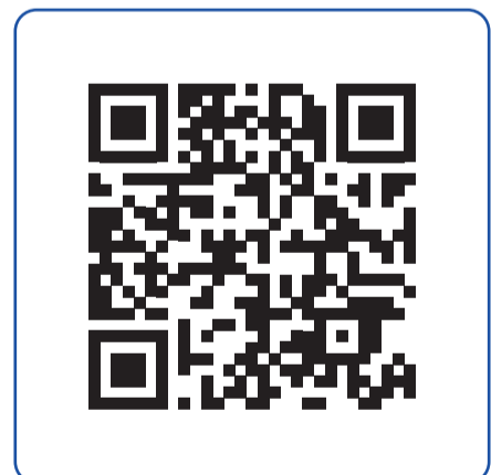
Martindale's ALIVE 5 fail proof steps to safe isolation