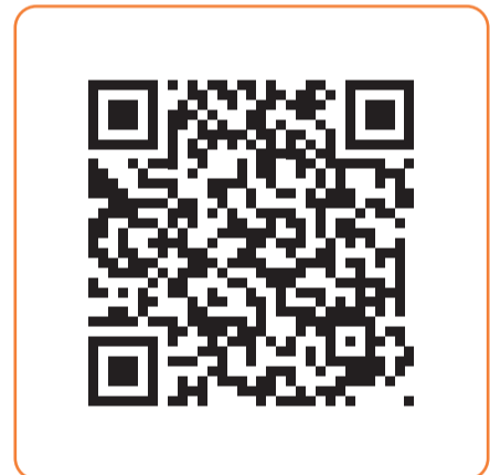
HSE - Electrical safety at work Safe working practices