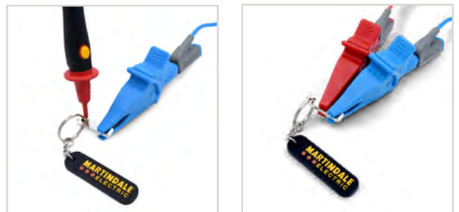
Fig 2. Using the Martindale accessory TL178 to null different lead configurations